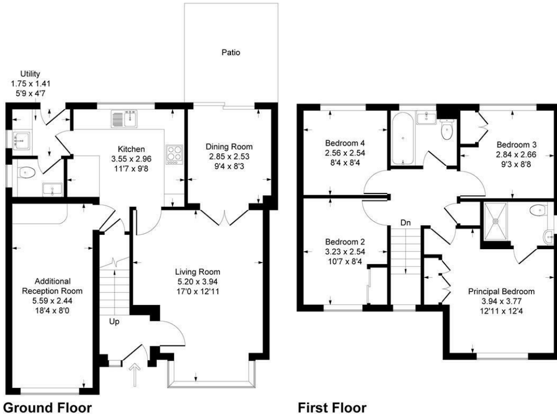
Illustration for identification purpose only, measurements approximate, and not to scale.

Approximate Gross Internal Area = 111.01 sq m / 1195 sq ft